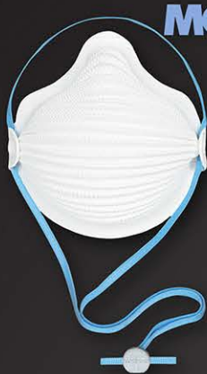
Moldex® 4600 N95 AirWave White Disposable Mask with SmartStrap®