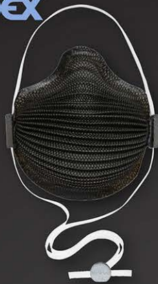
Moldex® M4600 N95 AirWave Black Disposable Mask with SmartStrap®